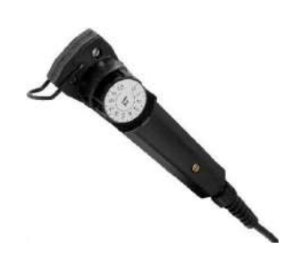
Optional remote control