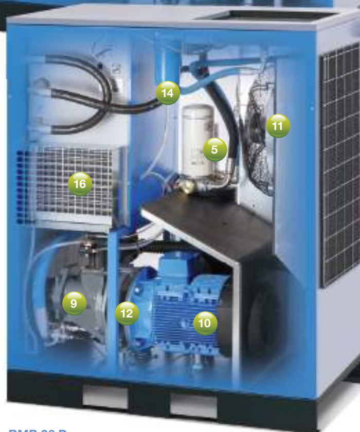
RMB 37 IVR D